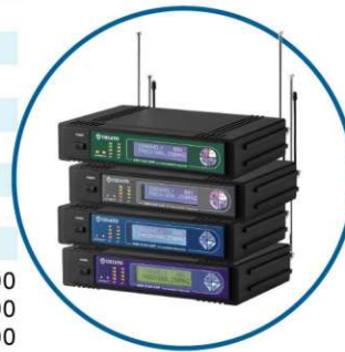
SDR-7200 SDR-6200 SDR-6100 SDR-3100