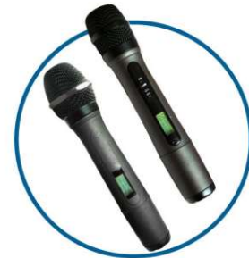
SQ-6000 SQ-6100 SQ-3000